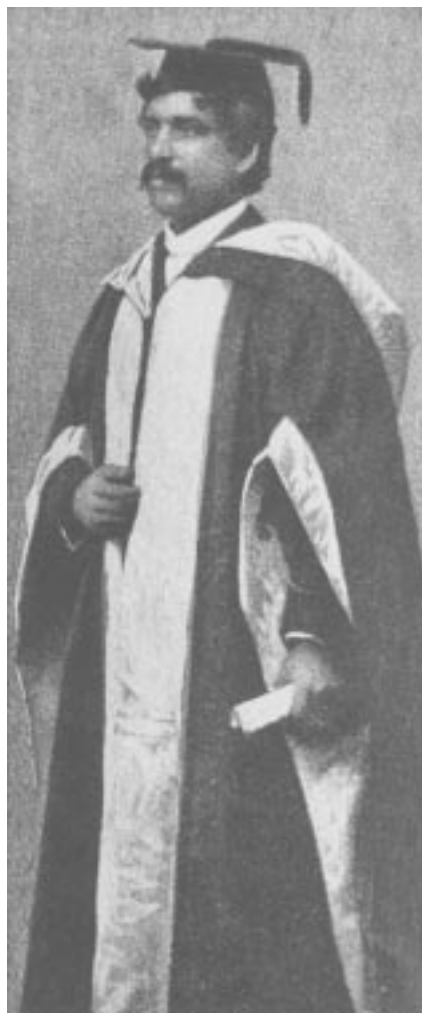
Fig. 6. Dr. Jagadis Chunder Bose.

The density of the ether has been calculated from the energy with which the light from the sun strikes the earth. As there are 27 ciphers after the decimal point before the figures begin, its density is of course less than anything we can imagine. From its density its rigidity has been calculated, and is also inconceivably small. Nevertheless, with this small rigidity and density it is held to be an actual substance, and is believed to be incompressible, for the reason that otherwise it would not transmit waves in the way it does. As it is believed to fill all the interplanetary space, many profound and searching experiments have been made to determine whether, as the earth moves in its orbit through space at the rate of 19 miles per second, it passes through the ether as a ship goes through the water, pressing the ether aside, or whether the ether flows through the earth as water flows through a sieve forced against it. Through the elusive character of the substance none of these experiments have as yet produced any very satisfactory results. It has been found, however, that the ether enclosed in solid bodies is much less free in transmitting waves than