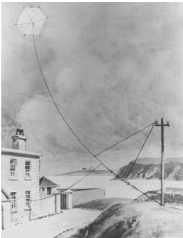
Fig. 3. Artist's rendering of the first transatlantic wireless signal reception.

the rude outlines of Cape Spear, the easternmost reach of the North American Continent. Beyond that rolled the unbroken ocean, nearly 2000 miles to the coast of the British Isles. Across the harbor the city of St. John's lay on its hillside wrapped in fog: no one had taken enough interest in the experiments to come up here through the snow to Signal Hill. Even the ubiquitous reporter was absent. In Cabot Tower, near at hand, the old signalman stood looking out to sea, watching for ships, and little dreaming of the mysterious messages coming that way from England. Standing on that bleak hill and gazing out over the waste of water to the eastward, one finds it difficult indeed to realize that this wonder could have become a reality. The faith of the inventor in his creation, in the kite-wire, and in the instruments which had grown under his hand was unshaken.