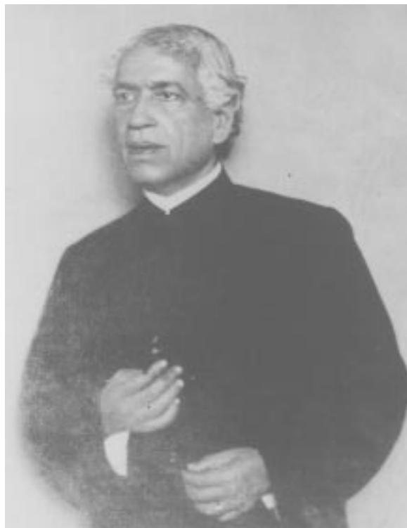
Fig. 1. Sir J. C. Bose.

Publisher Item Identifier S 0018-9219(98)00815-9.