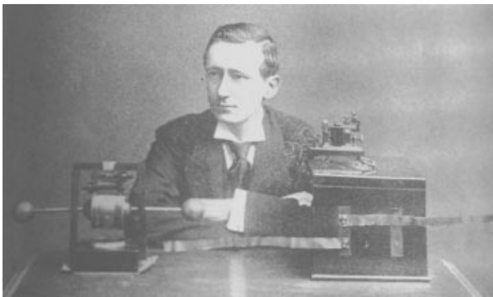
Fig. 8. Signor Marconi and his earlier apparatus for telegraphing without wires.

“Is the great field of the future, a field whose products no one can imagine or attempt to conceive.”