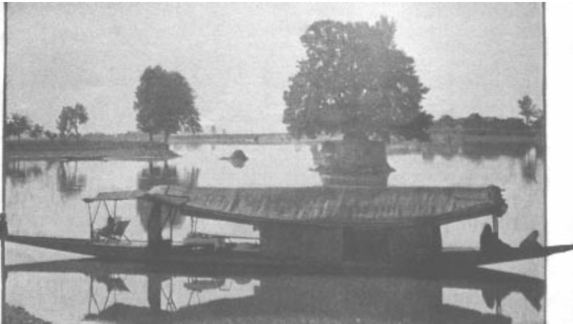
Fig. 9. Dr. Bose's houseboat.

study at his home in the last named city. He speaks English perfectly, and said, in his London home, in Westbourne Park: "For ten years past I have been an ardent amateur student of electricity, and for two years or more have been working with electric waves on my father's estate at Bologna. I was using the Hertz waves from an apparatus which you may photograph, a modified form of the apparatus for exciting electric waves as used by Hertz. My work consisted mainly in endeavoring to determine how far these waves would travel in the air for signalling purposes. In September of last year, working a variation of my own of this apparatus, I made a discovery."